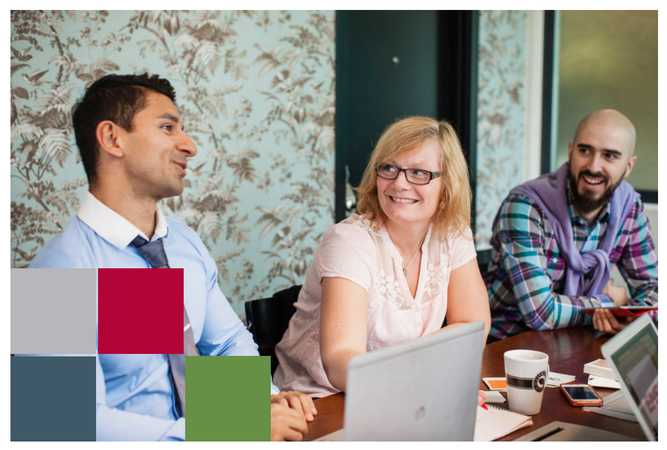
INFORMATION REGARDING PROPOSED REDEMPTION OF SHARES IN ENEA AB (PUBL) | 2016